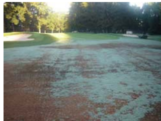
Little air movement, poor water management, and high disease pressure can lead to turf loss and lack of playability like #9 Fairway in 2006.

In last May's newsletter, I had this same category and the bottom line was to expect some problems and expect good playability, but this year expect much more. Mother Nature is always in control, I work for her most of the time; however, I have some base line goals and expectations.