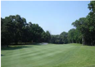
By June of 2007, the first hole benefited greatly from several improvements including new sod, tree clearing, and improved turf coverage. Now in June of 2008 most of the golf course has made the same leaps in turf quality.

Every month I write an article for the newsletter, but before I start I always read the last month's article and the article from the same month the year before. It was very interesting reading this time around to say the least. So I figured this month's article will best served as a measuring stick from last year as well as a base line for future progress.