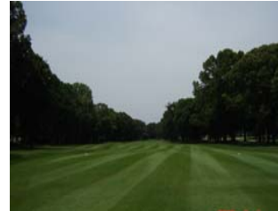
Dense turf can tolerate aggressive cultural practices such as growth regulators to kill poa annua, low moisture for firmness, and frequent mowing.

Weed control will again make huge improvements. Wet springs generally bring more weeds in the early months, but the extra rain also helps breed a healthy stand of turf able to tolerate the harsh herbicide treatments. I am already seeing this as the case this season, although (with the exception of clover) many of the weeds are pretty small when we take them out. Turf density will continue to improve. Over the last two years we have mowed the fairways at the same height. At first they seemed thin and tight, and now they are becoming much more forgiving. Last year I felt as though we were able to maintain the course dry except for the second half of summer. If it does stop raining this year, I believe we will be drier for a longer period of time. Humidity is the enemy of keeping the course dry; however, the new irrigation system is our best weapon