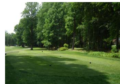
A change in turf species to rye grass has made 9th Back Tee Box meet the expectations of the golf course.