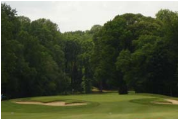
Because of higher turf quality around the golf course, definition of fairways, approaches, roughs, and bunkers has improved greatly.

Last season, our goal was to maintain playability throughout the golf season. We accomplished our goal. Weak areas of the golf course were evaluated and changed such as #17 tee box, the irrigation system, fairway drainage, and increased area movement.