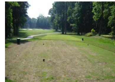
The back on the 9th hole is very slow to green up this spring despite stimulation in 2007.

"Golfers are required to exit the fairways at a 90 degree angle ... remain in the fairway until you reach the cart sign directing you off the course"