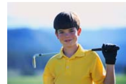
“2008 Junior Golf Academy Go to our website for details”