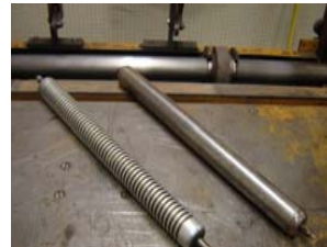
A grooved, Whiele Roller (left) and the solid roller, used in the summer (right)

I also receive a few questions about the height of cut for the rough. The rough seems shorter, yet thicker. Because the Maintenance Department is able to mow the rough more frequently, with a better quality, and improved irrigation coverage keeps the grass moist; now the rough is very consistent throughout the golf course. Although it will naturally thin out for the summer, the rough will bounce back quickly in September. The rough is usually thinner than normal outside of the reaches of our irrigation, but the heavy amounts of rain have maintained the far reaches of rough approaching the summer season.