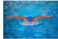
“Swim Team Banquet July 27 th ”