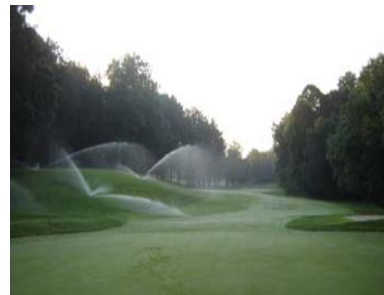
"On hot, sunny days golfers can expect to see sprinkler heads cooling off the grass."

The Practice Area is now receiving heavy use daily. It is closed for Monday outings and several outside tournaments. Please remember no range balls are allowed. All divots must be replaced, filled with sand, or both. Replacing and sanding will help maintain its playability throughout the summer. Please spread out your use. Don't drop dozens of balls in the same area. As some areas become too beaten up, it will be roped off, seeded, and top dressed. It may not reopen until it is healed. Turf's ability to heal itself is greatly reduced during the summer stress period. Because of the heavy use over the years the Maintenance Department has plans to build up the turf areas this fall; however, we want to have as much to work with in September as possible.