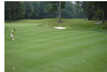
Gentlemen using the whole practice area while toting a bottle of sand with him