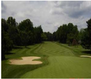
The new mowing equipment is having an impact. On #11, the rough is much more consistent with the new mower and the walk-mowed approach is much tighter. Currently the "wait list" dues are contributing $4,000/month to the Membership Fund, but it could earn as much as $7,000/month with a full wait list.

The solid rollers are key to keeping the greens smooth, but the less aggressive cut can make the greens a bit slower. We compensate the reduction in speed with growth regulators and rolling more frequently. The net effect is zero to the golfers on most any day.