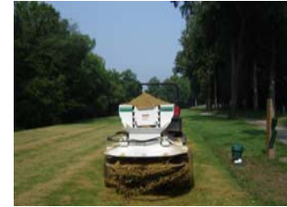
The sand is spread out using our top-dressing machine. The same process is done to both greens and tees.

Top dressing is spreading an even coating of sand to fill the holes and smooth the surface. We have our sand tested to make sure it is compatible with our soil types and doesn't contain silt.