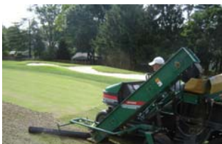
Russ is shown using the core harvester. This machine can decrease the clean up time, but in unskilled hands, it can destroy a green's surface.