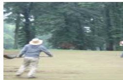
If the greens are wet, like after a shower, the cores must be removed by hand.

Cleaning up the greens is important to create a smooth playing surface. This is the most labor intensive part of the process.