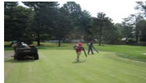
Tom and Justo blow off any remaining cores using backpack blowers.