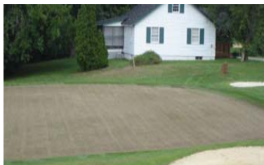
The green is aerated using 1/2" tines, 1.5" apart, and 4 1/2" deep. The cores are allowed to dry for 2 hours.

Good spacing and depth are essential to successful aeration. The max surface area disturbance without destruction is 5%, which is our goal. Depth is key to increase root depth and water movement. For years, the greens here were only aerated at 3 1/2'.